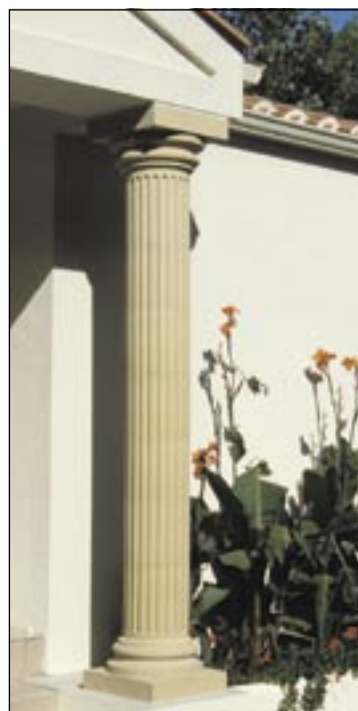
Dia.26 fluted shaft