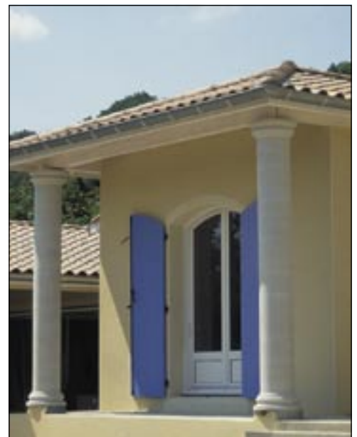
Dia.35 smooth shaft