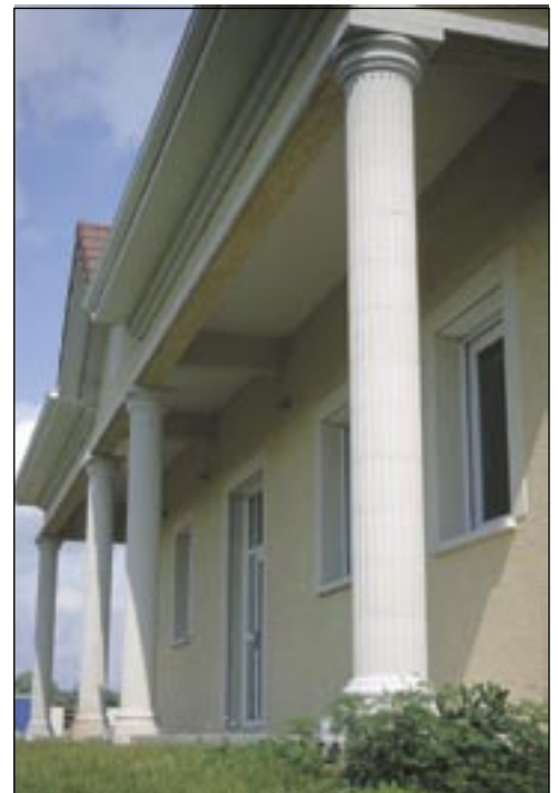
Dia.35 fluted shaft