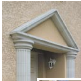
Pedimented portico on dia.26 columns